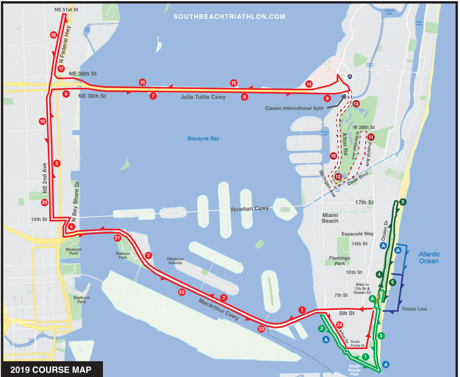
2019 COURSE MAP